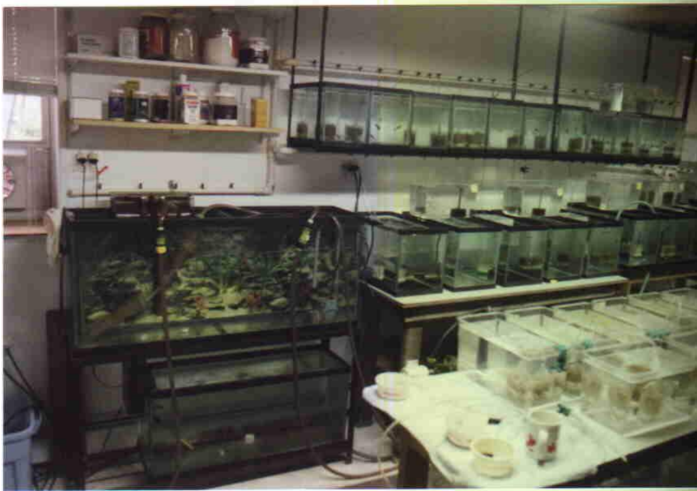
Gene's New fish room