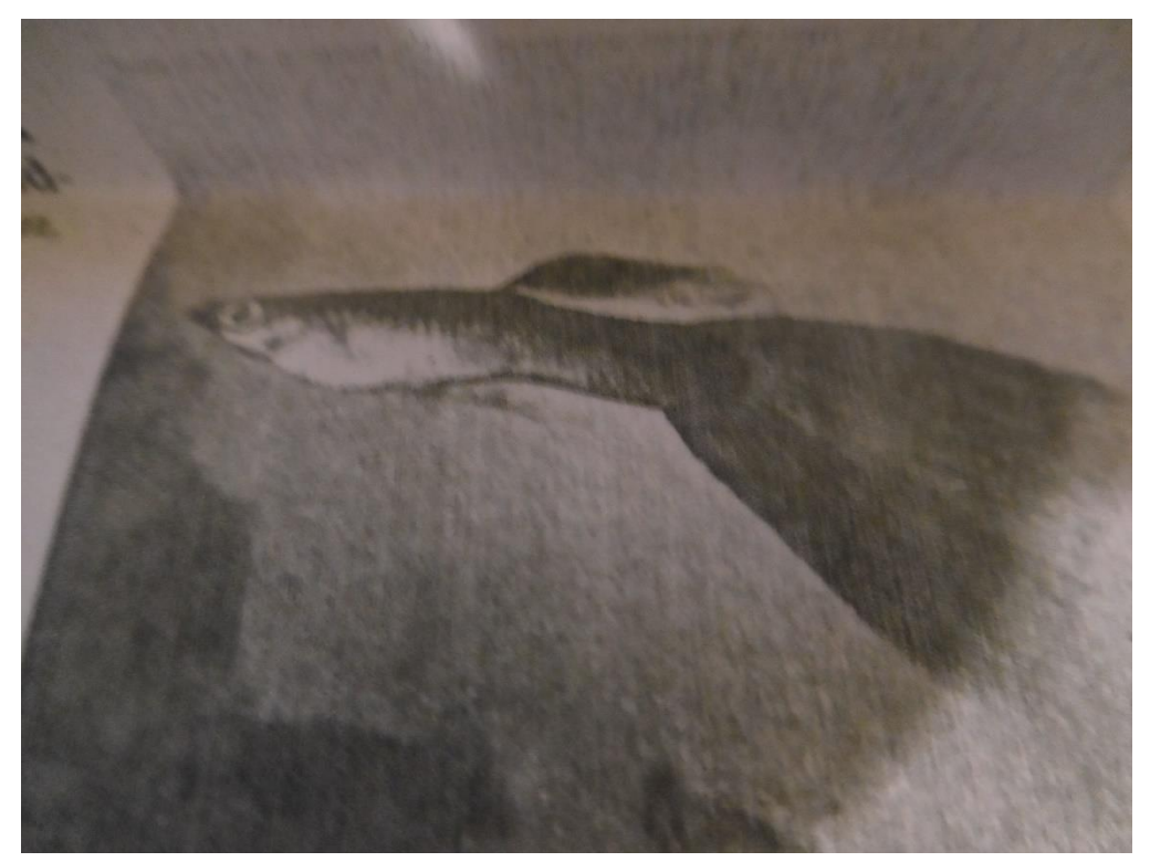
This veiltail Hannel guppy took two to four years to develop. It is 11/2 inches long.