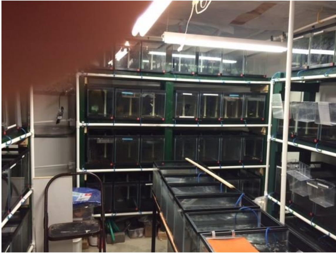
My present fish room 135 tanks (2016)