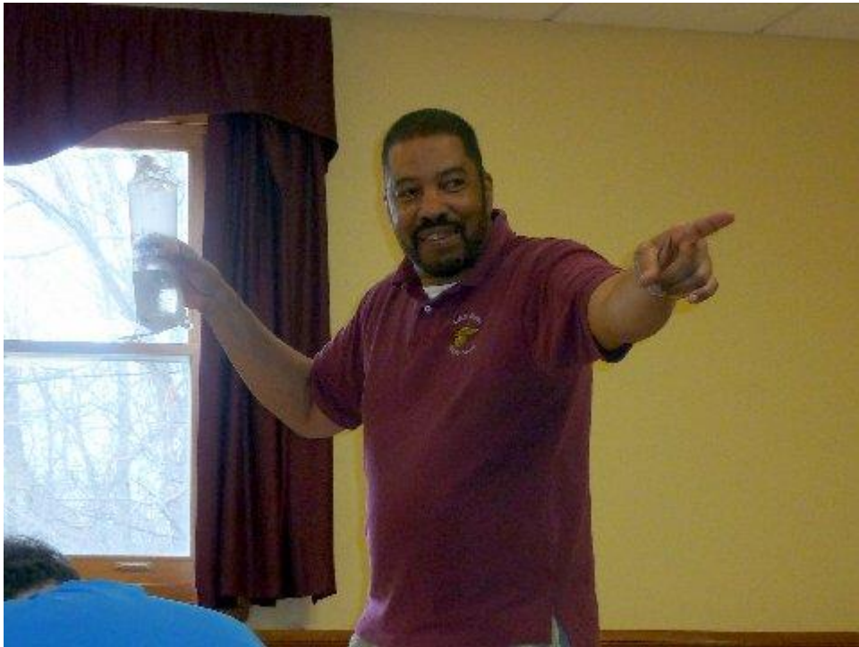
South Jersey Monthly auctioneer