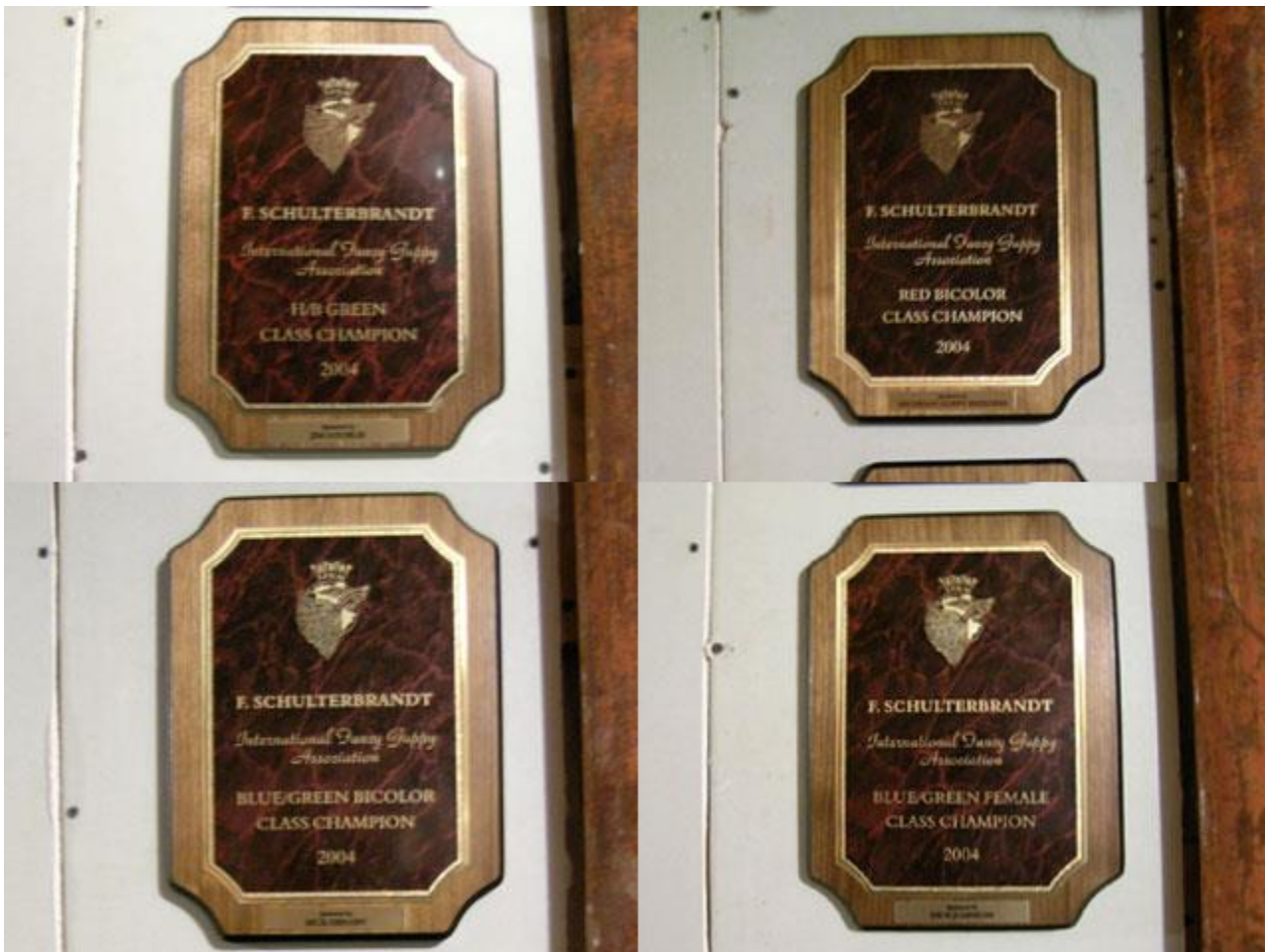
Four IFGA Color Class Championships the year 2004.