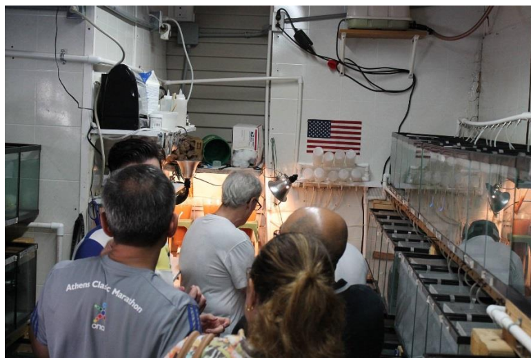
Steve's current fish room in Sebring Florida