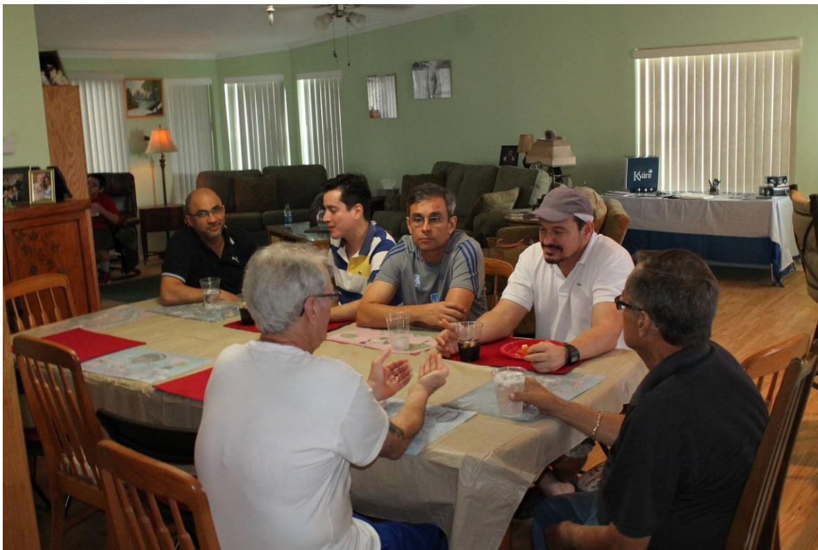
Serious international guppy conversation....